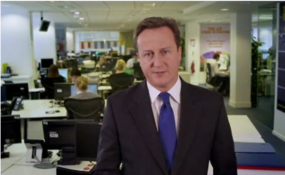
UK Prime Minister, David Cameron

The policy was disclosed after Mr Cameron defended his decision to legalise gay weddings when he addressed last week's Conservative Party conference.